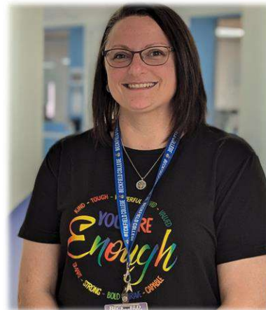
AASBA Spotlight Graduate

For information about employment and occupational related items published by the U.S. Bureau of Labor Statistics visit https://www.bls.gov